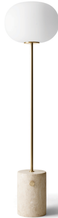
Travertine / Brushed Brass 1840619