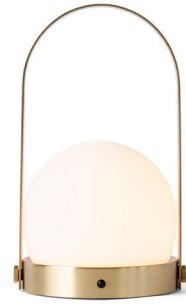
Brushed Brass 4863839