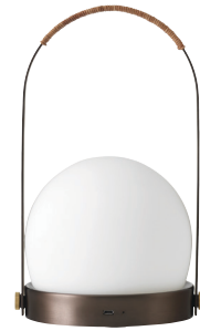
Bronzed Brass 4863859