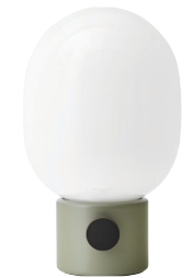
Ammonite Grey, Steel 1800089