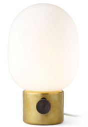
Polished Brass 1800839