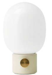
Alabaster White, Steel 1800360