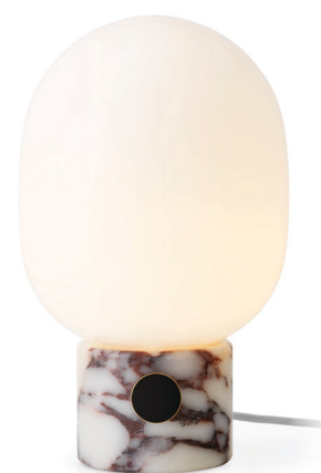
Calacatta Viola Marble 1830319