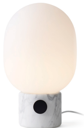
Carrara Marble 1830639