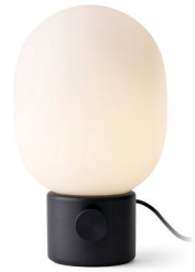
Black Steel 1810539