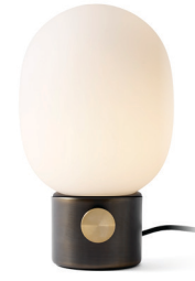
Bronzed Brass 1800859