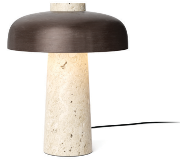
Reverse Table Lamp, Bronzed Brass 1410619