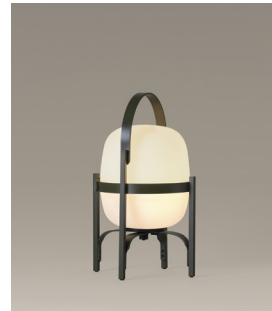
Olive green aluminium